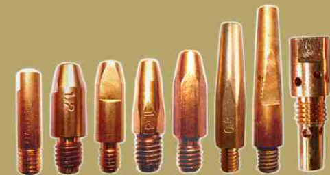
MIG WELDING CONTACT TIPS & HOLDERS