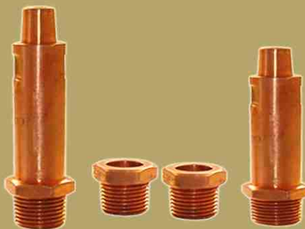
SPOT WELDER SCREWED ADAPTORS