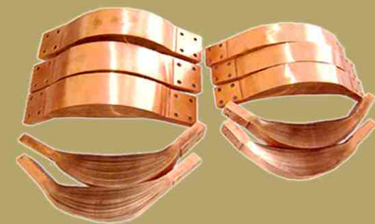
FLEXIBLE LAMINATED SHUNTS