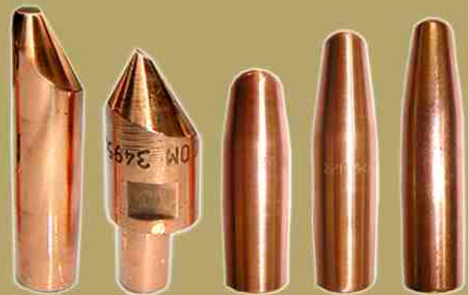
SPOT WELDING ELECTRODES