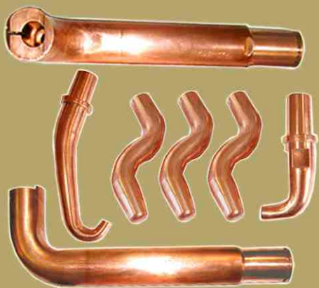
BENT AND SPECIAL ELECTRODES