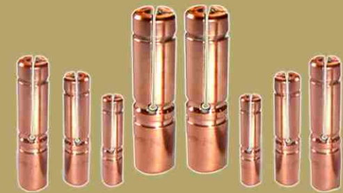
STUD WELDER COLLETS