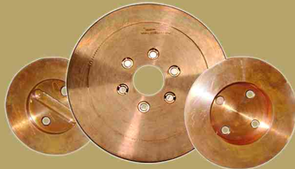
SEAM WELDER WHEELS