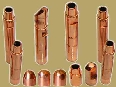
SPOT WELDER CAP TIPS AND SHANKS